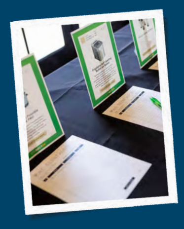
Preview the silent auction by visiting unitedag.org/silentauction

Silent Auction closes at 8 pm Wed., March 19