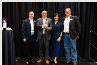
Service Rep Awards